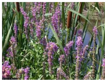
purple loosestrife & cattails

Examples of plants to control in your stormwater pond: